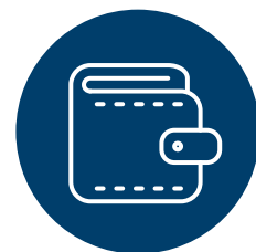
XENIAL DIGITAL WALLET