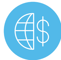
XENIAL STORED VALUE